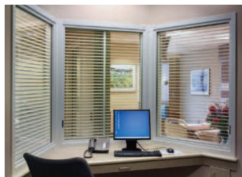
3-panel alcove configuration previously installed at William Beaumont Hospital

Vision Control® was chosen over switchable glass with liquid crystal because it offers total privacy at night. Whenever the nurses need to check on the patients, when using liquid crystal windows, the room gets illuminated instantly, compromising the restful environment. On the contrary, when using Vision Control®, nurses can discretely open the louvers toward the rooms without disturbing the patients, offering them the intimacy they require.